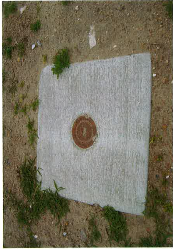
Typical well pad completion for MW-1, MW-2, & MW-3