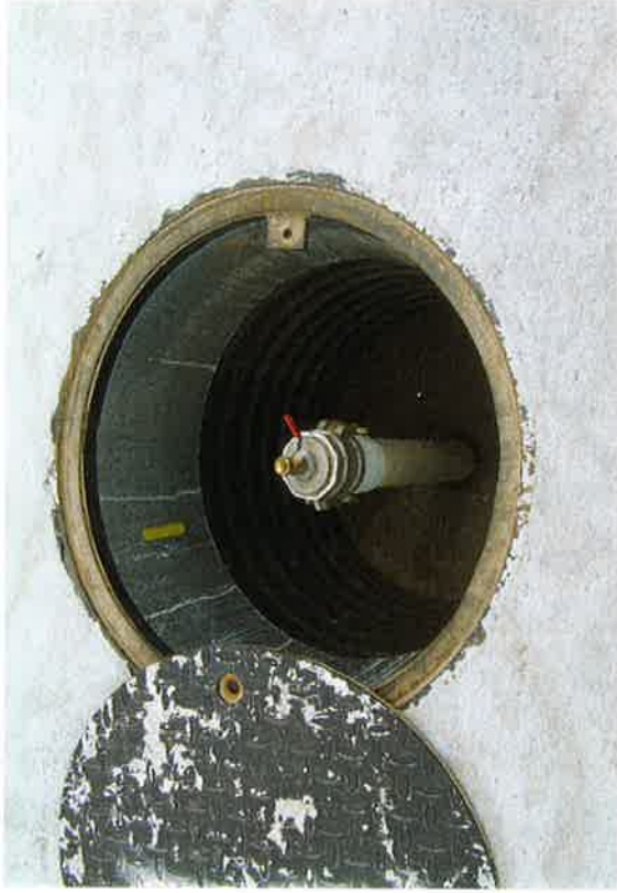
Typical sparge well completion