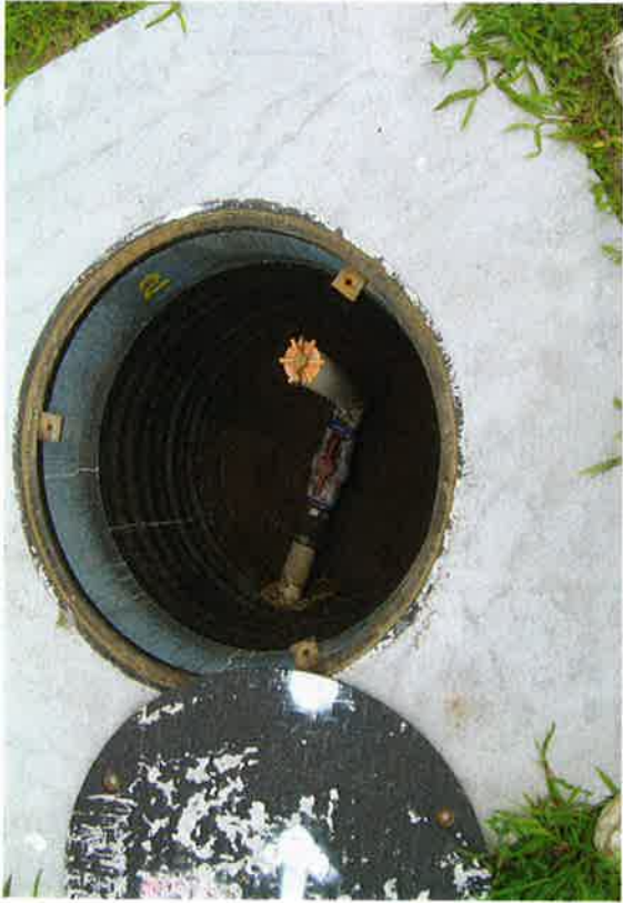
Typical soil vent well completion