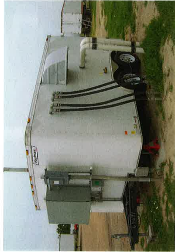
Equipment trailer showing connections to SVE and sparge manifold