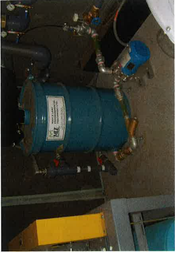
SVE knock-out tank and transfer pump