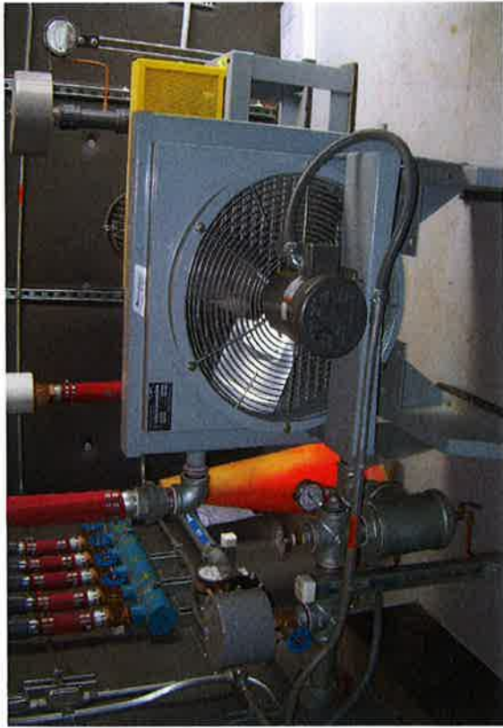
Sparge blower heat exchanger