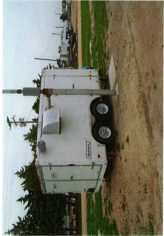
Equipment trailer showing exhaust stack & silencer