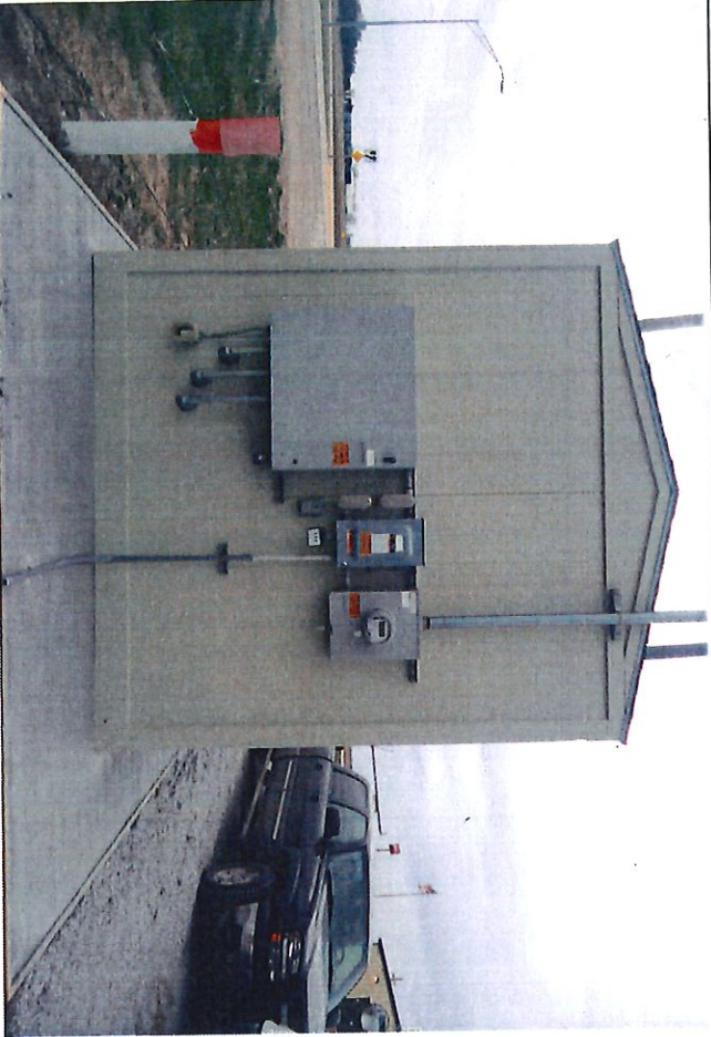
View of east side of remediation building after being re-painted.