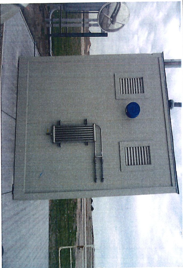
View of north side of remediation building after being re-painted.