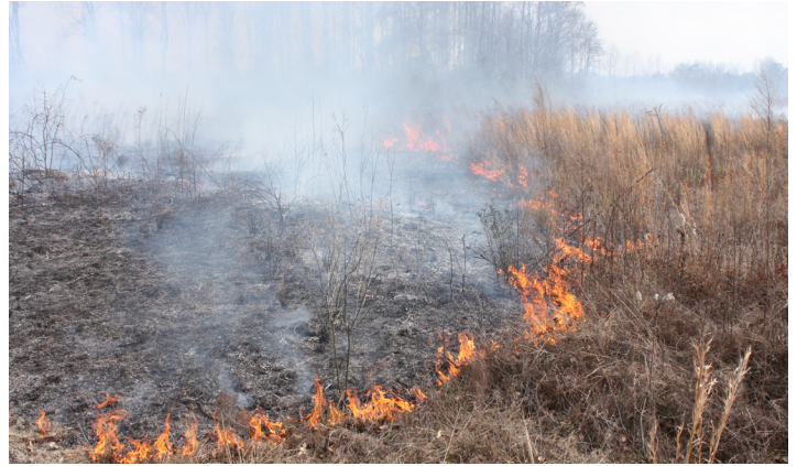
Two types of wildland fires exist — prescribed burns (pictured above) and wildfires. While both produce smoke, prescribed burns can reduce the intensity of wildfires in the long run.

Smoke from wildland fire lowers air quality and may cause health problems. Recommended steps to reduce or limit your exposure to smoke have been developed by the wildland fire science community, in partnership with public health and air quality officials. Below are some questions and answers that explain the challenges of the growing wildfire problem in the central United States, why prescribed burning takes place, and what you can do to limit smoke exposure if it occurs in your community.