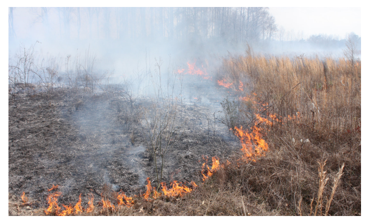
Two types of wildland fires exist — prescribed burns (pictured above) and wildfires. While both produce smoke, prescribed burns can reduce the intensity of wildfires in the long run.

Smoke from wildland fire lowers air quality and may cause health problems. Recommended steps to reduce or limit your exposure to smoke have been developed by the wildland fire science community, in partnership with public health and air quality officials. Below are some questions and answers that explain the challenges of the growing wildfire problem in the central United States, why prescribed burning takes place, and what you can do to limit smoke exposure if it occurs in your community.